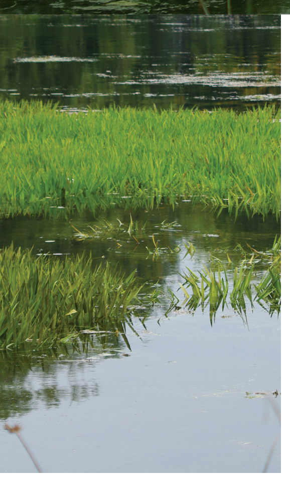
Water soldier invading the Trent Severn Waterway.

Water soldier is an invasive perennial aquatic plant that is native to Europe and northwest Asia. The only known wild populations in North America occur in Ontario, within the Trent Severn Waterway (near the Hamlet of Trent River, ON), and the Black River (near Sutton, ON). Prior to being regulated as a prohibited invasive species under Ontario's invasive Species Act, water soldier was sold in Ontario for use as an ornamental plant in water gardens, the likely source of its introductions to Ontario.