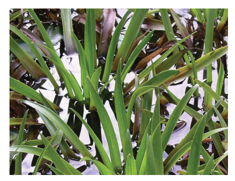
Identifying water soldier.

Since the water soldier populations in Ontario are the only known wild occurrences in North America, it is very important to prevent the plant's introduction and spread to new locations. The Ministry of Natural Resources and Forestry, with support from partners including the Ontario Federation of Anglers and Hunters, Trent University, conservation authorities, and Parks Canada is monitoring and tracking the spread of water soldier within Ontario waterbodies and undertaking a variety of control measures to prevent its spread to new locations.