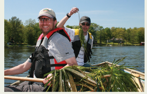
MNRF staff monitoring for water soldier.